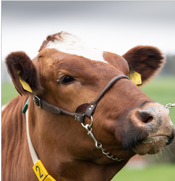
KNOWE BARBIE 2 , classified Ex91 is bound for the sale later in the year Ref:RH260421341