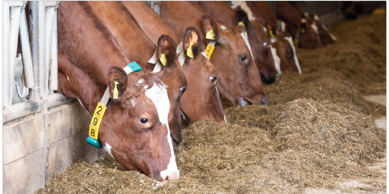
COWS ARE fed a TMR mixed in a Keenan fed wagon, with high and low yielders fed for maintenance plus 35 litres and 22 litres, respectively. There are with no in or out of parlour feeders Ref:RH260421326

and White and the Holstein here although the black and whites tend to hold their peak yields for longer but we're not looking for big, extreme cows."