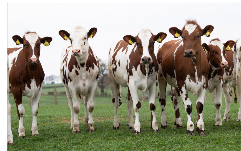
WITH THE better weather, this small group of yearling heifers are out at grass Ref:RH260421349