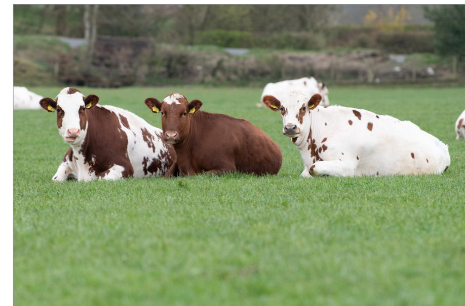
IN-CALF HEIFERS out at grass and due to calve at 25 months of age Ref:RH260421333