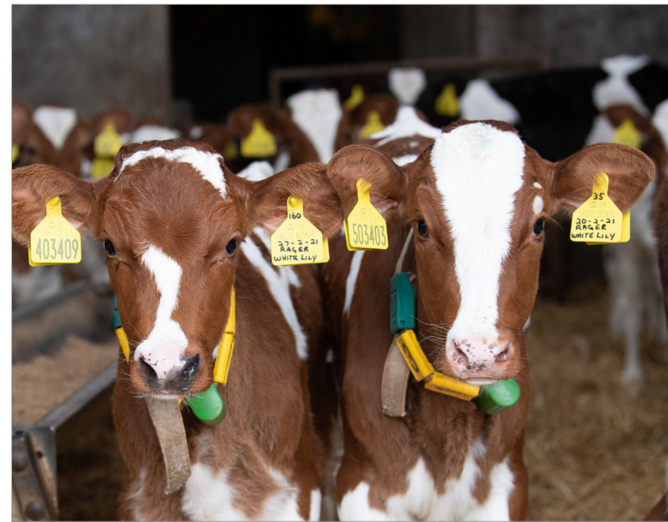
SEXED SEMEN is used on the top 100 cows and maiden heifers. In recent years, all the best dairy heifers have been retained on farm – hence the reduction sale in July Ref:RH260421347