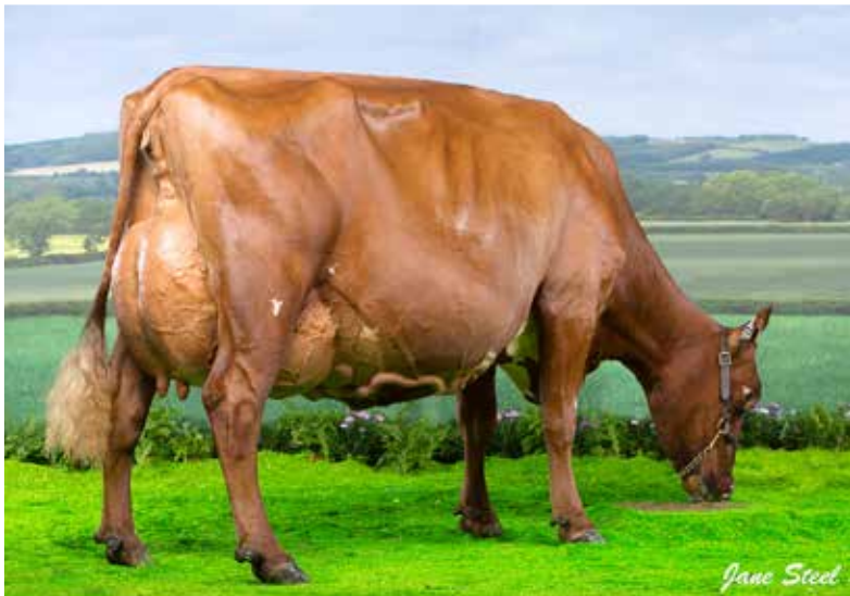
HORSECLOSE JOANNA EX95-3E

Muirston Joanna 9 EX94 12327kg 3.57% 3.25%