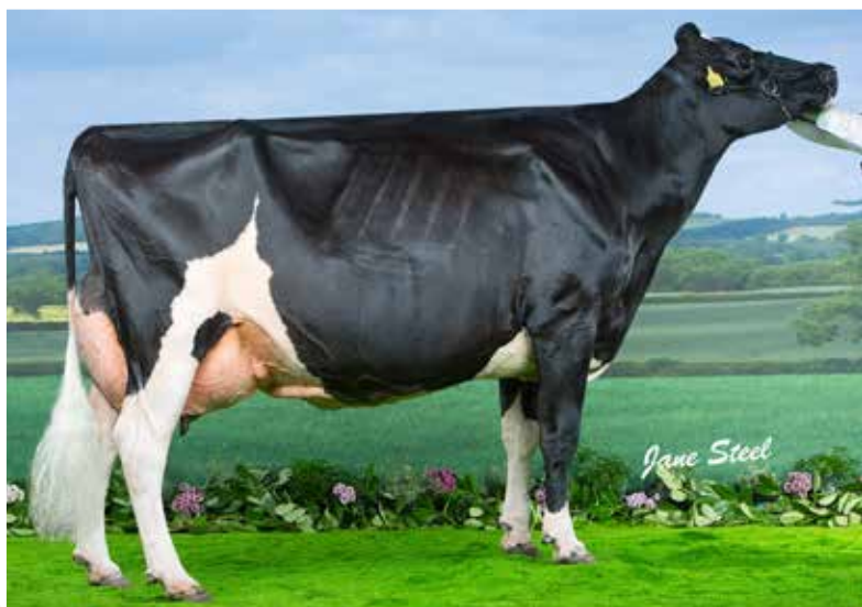
BOCLAIR GOLDWYN ELEGANCE ET EX95-4E