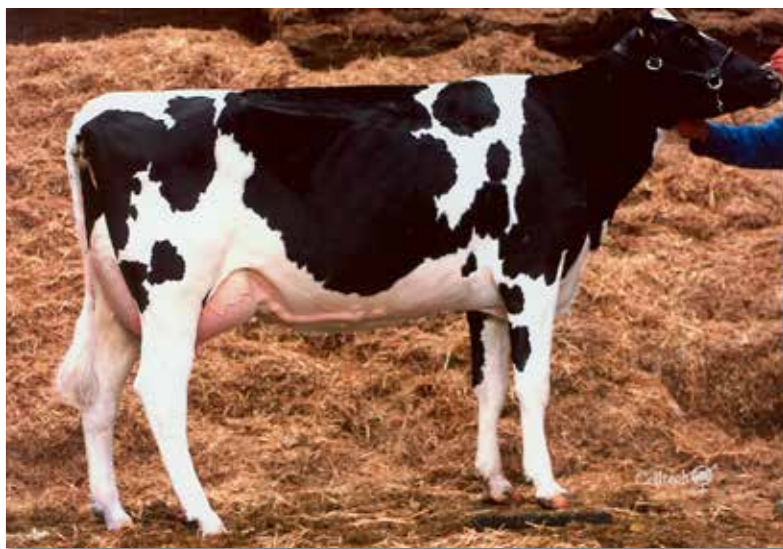
STERNDALÉ RI SPOTTIE PI ET EX90