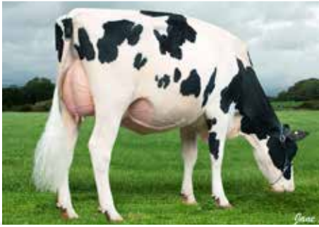
ABSOLUTE DOORMAN ARINGADINGDING VG88