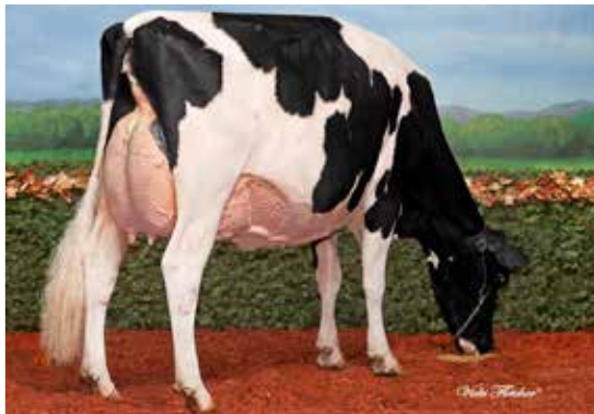
KINGSWAY SANCHEZ ARANGATANG ET EX95-2E 6* LP60