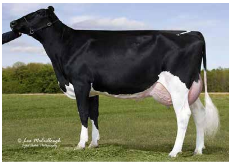
MS GOLDWYN BRIA ET VG86