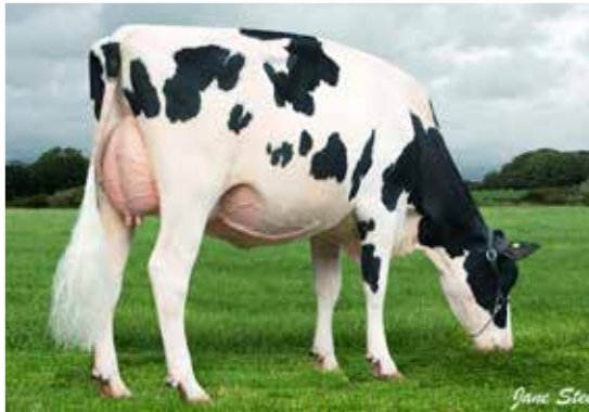
ABSOLUTE DOORMAN ARINGADINGDING VG86 (2YR) LP60

Hon Mention Intermediate Champion Royal Winter Fair 2006