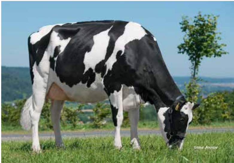
ZANDENBURG SUPER CAMILLA VG85

Sold for €6,000 Holland Masters Sale 2010 Embryos Exported to Japan, USA and More