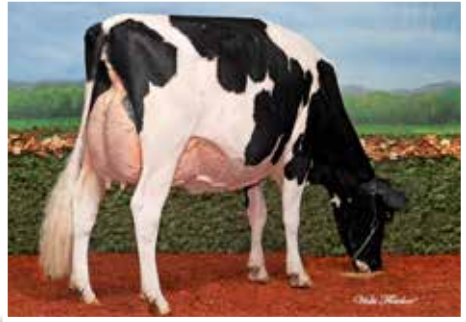
KINGSWAY SANCHEZ ARANGATANG ET EX95-2E 6* LP60