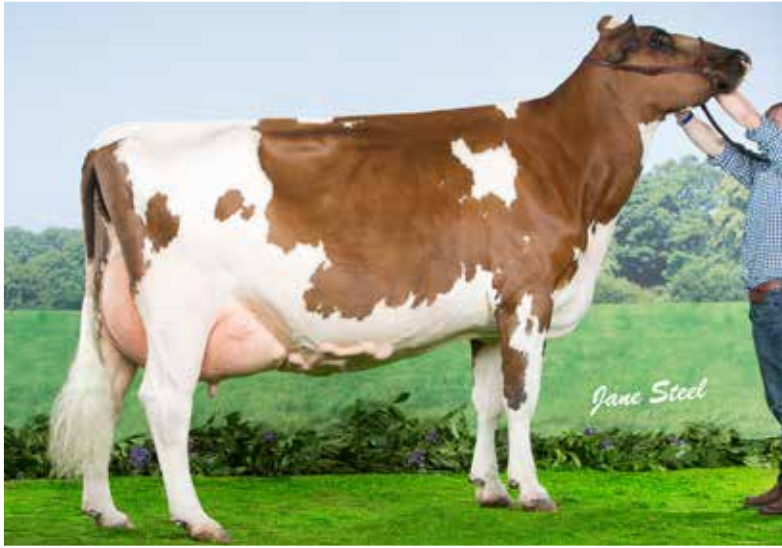
HUNNINGTON JOYBELL 83 EX93