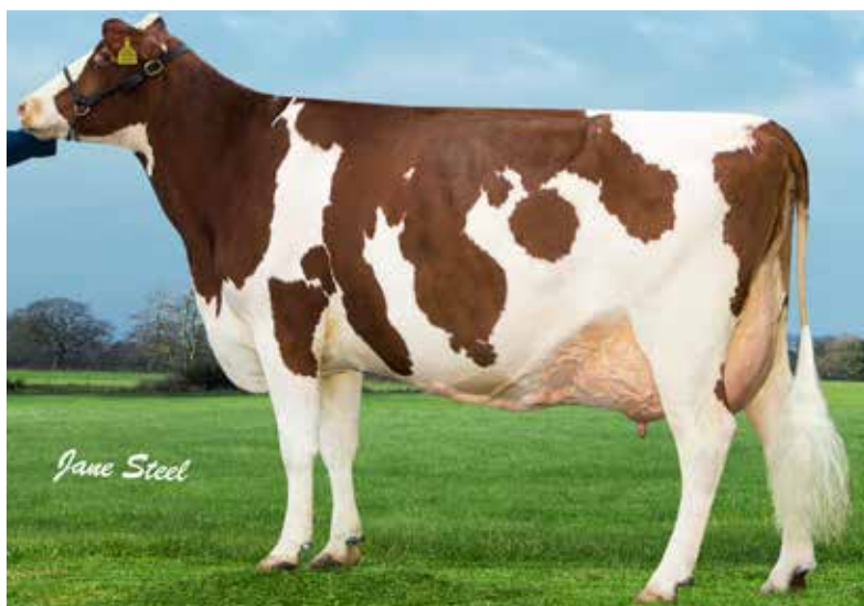
WEST MOSSGIEL MISS MODERN 28 EX91