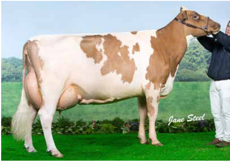
CUTHILL TOWERS RADAR RAY 13 EX94-2E

1 02/06 5478 4.37 3.45 305 2 03/07 5661 4.30 3.64 298 3 05/01 5557 4.05 3.50 285 4 06/03 6077 4.53 3.51 271 5 07/03 7356 4.48 3.59 300