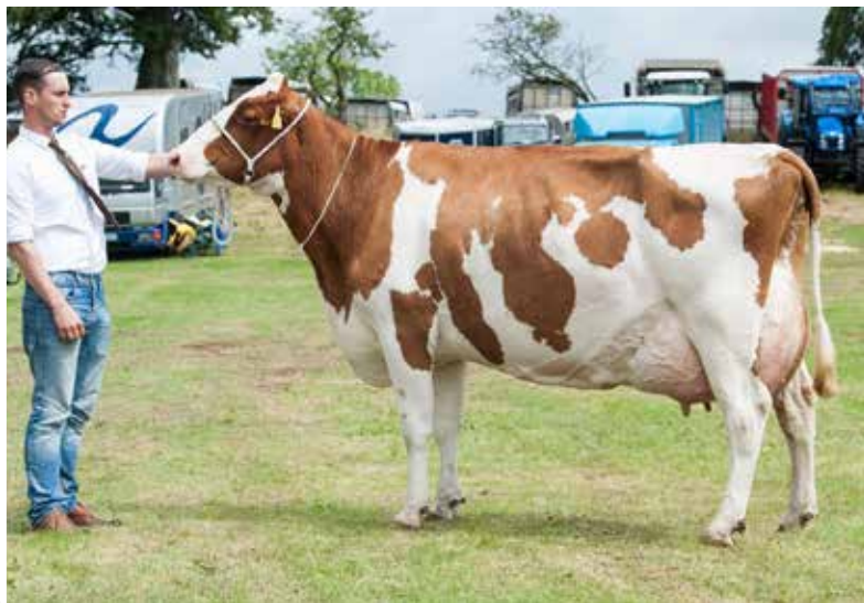
WEST MOSSGIEL MISS MODERN 28 EX91