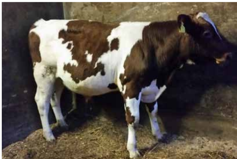
PRIESTLAND RELOUGH (PICTURES AT 7 MONTHS)