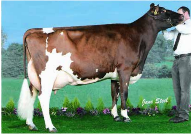
SWAITES BUNCE 4 EX91 LP60