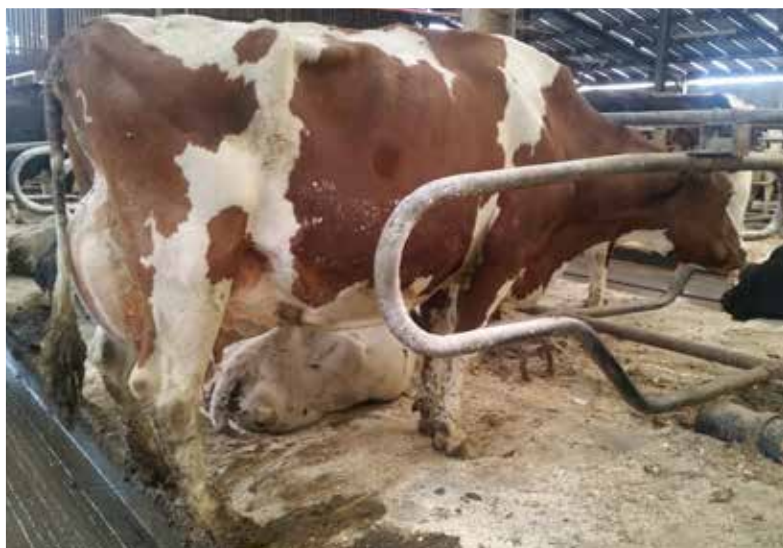
GARTHLAND REDWING EX94