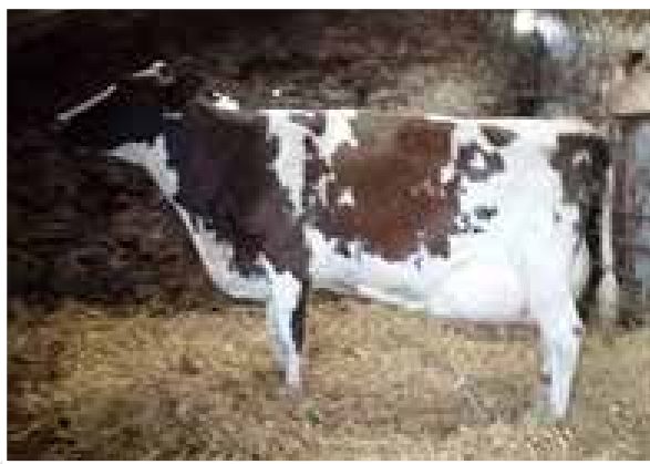
BRUCHAG WHITE JULIA