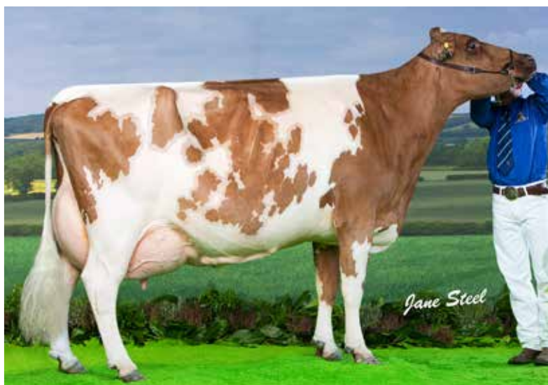
HARESFOOT NAPIER BELLA ET EX93-2E