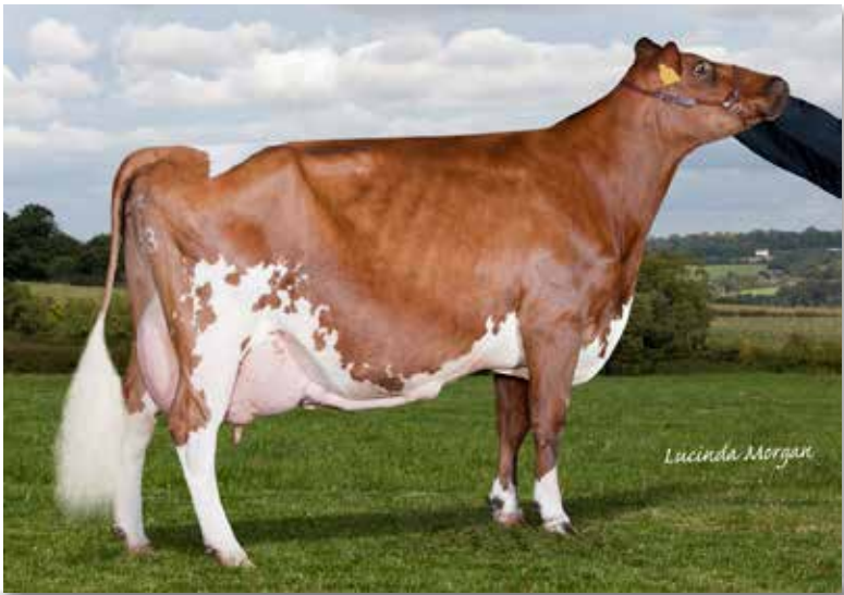
MIDDLE PUNCHS EMERALD BLEND EX95-8E