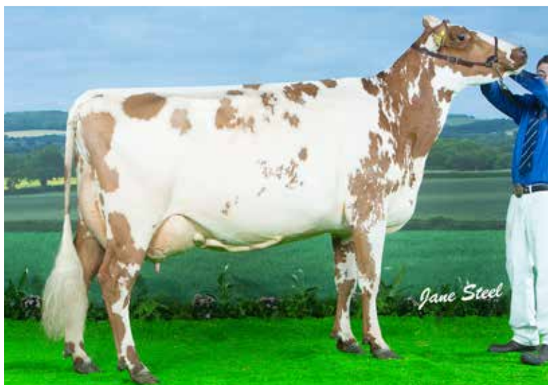
HOLMESWOOD ELEGANT BELLA VG86