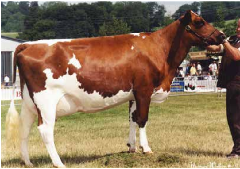
HUNNINGTON JOYBELL 30 EX94-2E