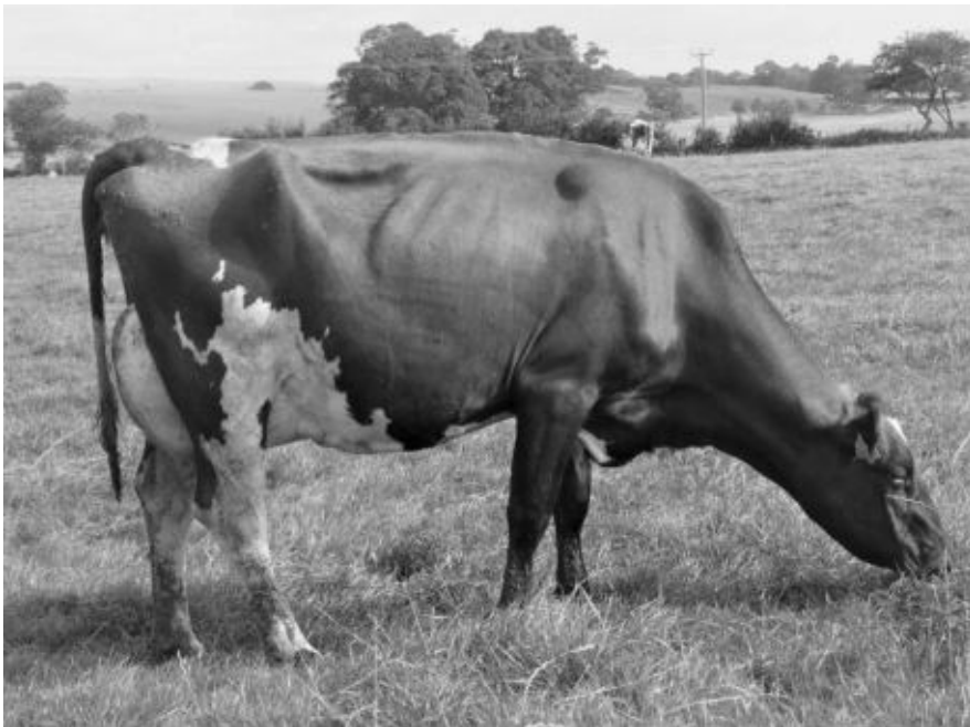
LOT 21 MIDDLE EMERALD CTHD