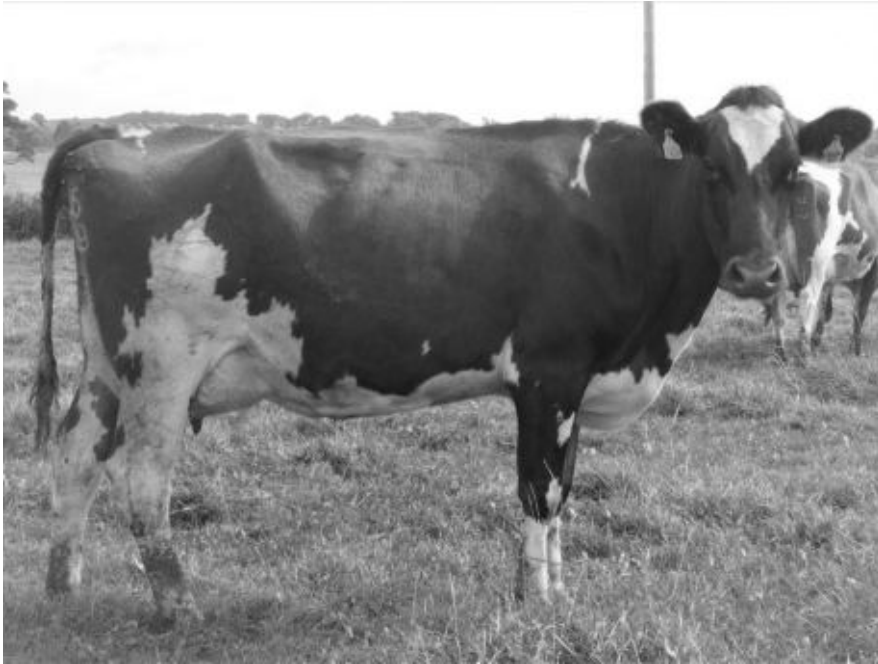
LOT 16 MIDDLE ANNS CELANDINE CTHD GP82