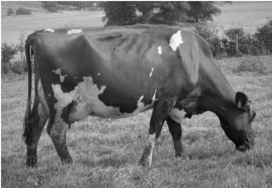
LOT 377 MIDDLE MEG KJ VG86(5YR)