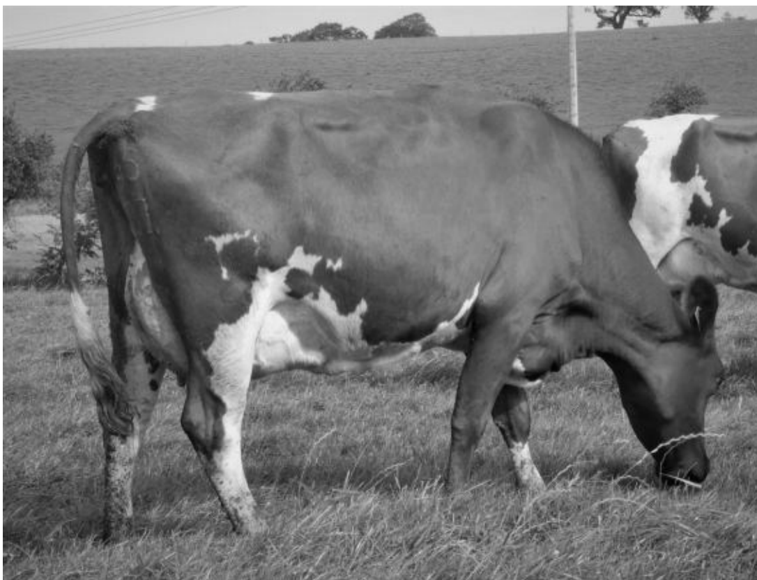
LOT 300 MIDDLE LOVELY MS 3

Dam: Middle Lovelys Savy 1405005399 by Middle Savy 1408000062 5 06/07 10031 4.29 3.15 305 6 07/08 6449 4.49 2.63 141 GDam: Middle Regent Mel 0304118305 by Morwick Prince Regent 0300176086 3d: Middle Lovely Mel 0304111543 GP84 by Middle Emerald Last 0307190579 1 03/07 3475 6.98 4.44 238 2 04/07 5771 2.97 3.02 180