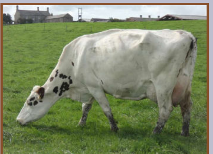
LOT 241 MIDDLE JEAN JC EX90