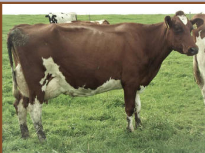
LOT 395 MIDDLE NOZZLE CTHD