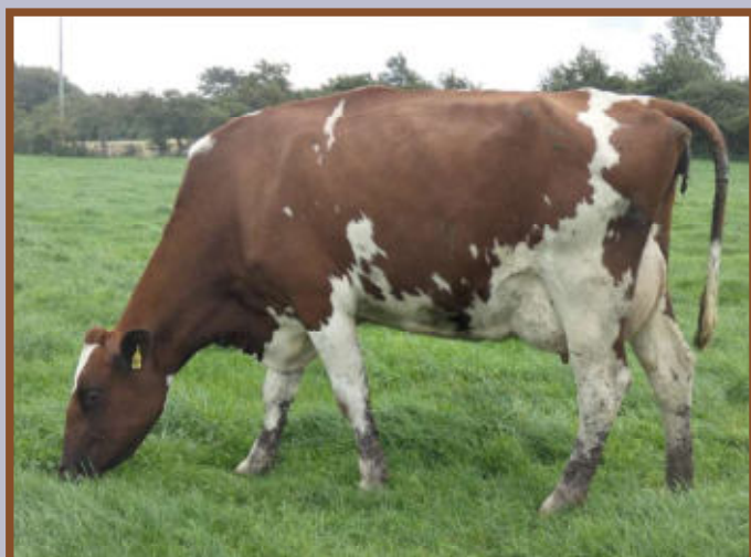
LOT 1 MIDDLE MOLLI M SPOTEM VG86