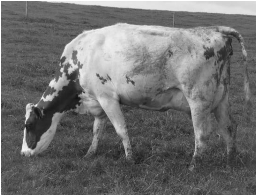
Maternal sister to LOT 127, LOT 314 and LOT 334

Dam: Middle Margot Mmb 2 1405003708 by Middle Myladys Boy 1408000042 GDam: Middle Margot 344 0304116097 VG88 by Morwick Solano Red 0100622352 3d: Middle Margot Mbb 0304108437 VG85 by Middle Brown Boy 0307190435 1 03/08 5220 4.53 3.80 293 2 04/10 7030 3.92 3.64 305 3 06/00 9461 4.44 3.34 305