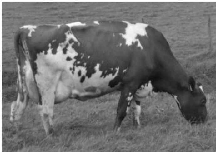
LOT 400 MIDDLE MARGOT MS 2 VG88(4YR)