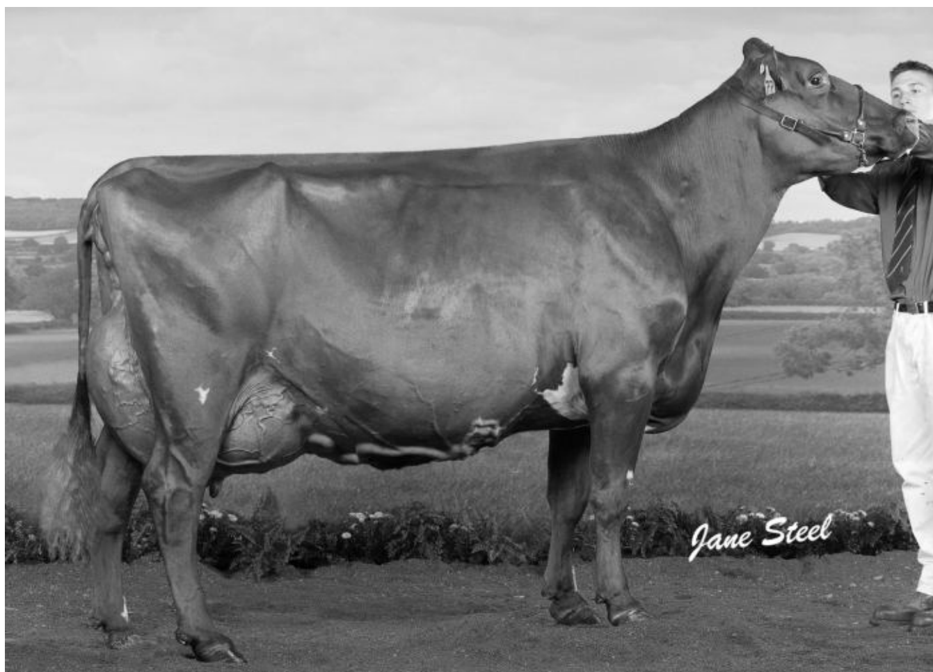
Horseclose Joanna EX95-3E LP60 - Dam of Horseclose X Man LOT 451 She is also the dam of Service Sire Horseclose Yuppie

1 02/08 5721 4.26 3.31 305 2 03/08 6414 4.04 3.36 297 3 04/09 7484 4.01 3.37 305