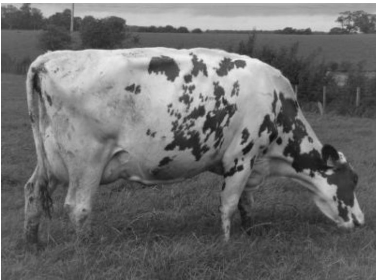
LOT 408 MIDDLE POPPY MD

Dam: Middle Priscilla Mf 0304126983 by Middle Frontman 1408000121 GDam: Middle Priscilla 15 0304116142 by Middle Dunlops Man 0307190667 3d: Middle Priscilla Km 0304094854 by Ketby M E Milestone Red 0100573805