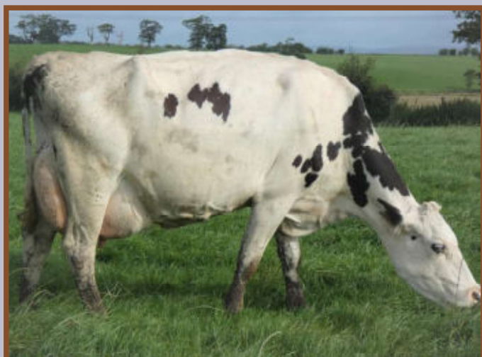
LOT 51 MIDDLE MITZY EMJ 5 EX90