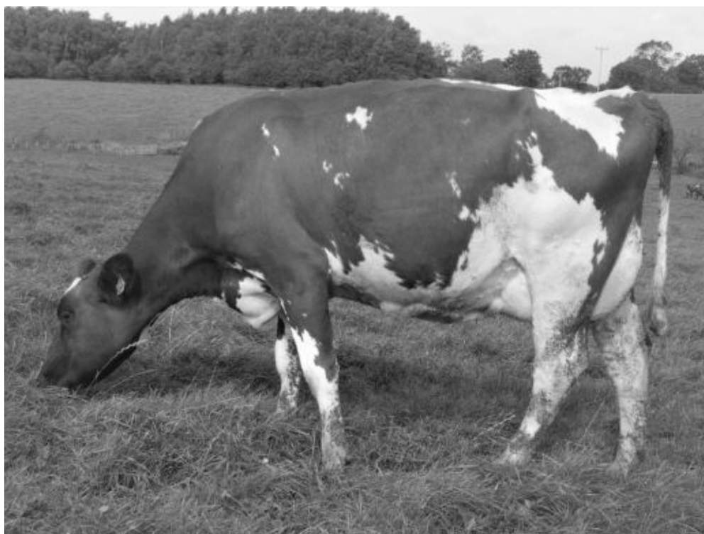
LOT 282 MIDDLE MARGO MS 4 GP82

6 07/05 8071 3.90 3.33 305 7 08/06 7083 4.59 3.36 253