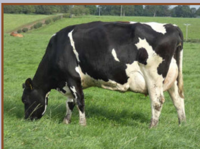
LOT 48A MIDDLE MITZY SB 4 EX90