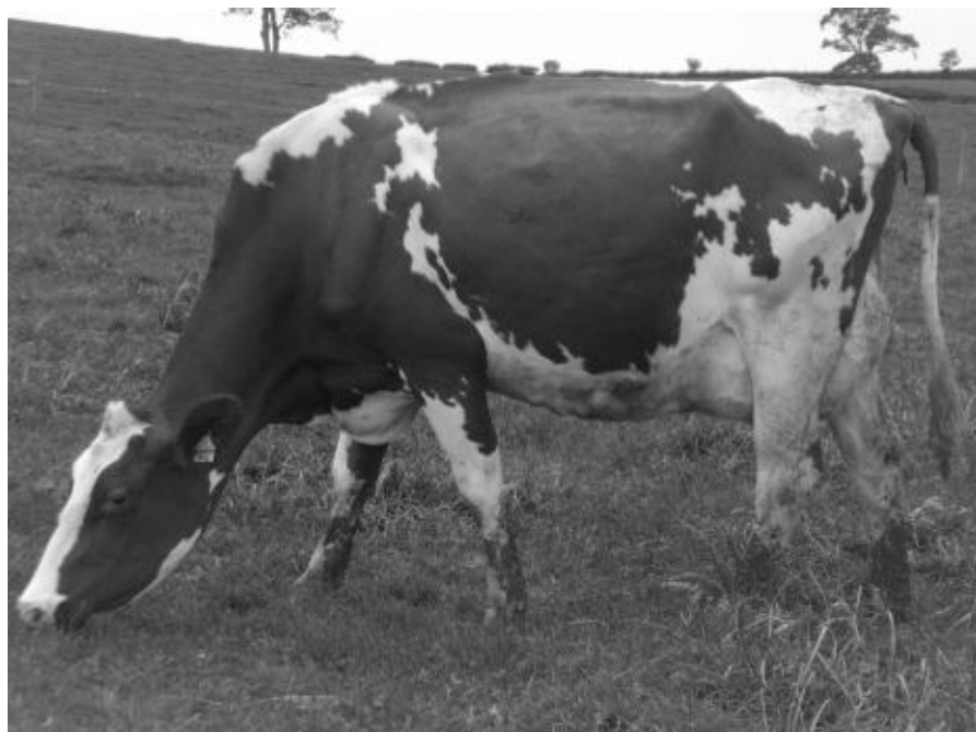
LOT 303 MIDDLE JEAN MS 5 GP83

Dam: Middle Pique Mmb 1405001391 by Middle Myladys Boy 1408000042 GDam: Middle Pique 3 0304116059 by Rulesmains Jordan Red 0308195082 3d: Middle Pique Sr 0304108571 by Middle Sweet Ranger 0307190434