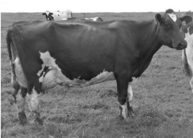
LOT 395 MIDDLE NOZZLE CTHD