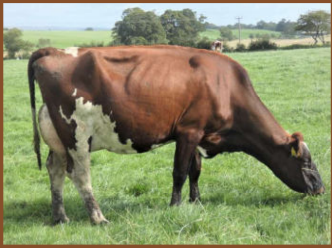
LOT 21 MIDDLE EMERALD CTHD