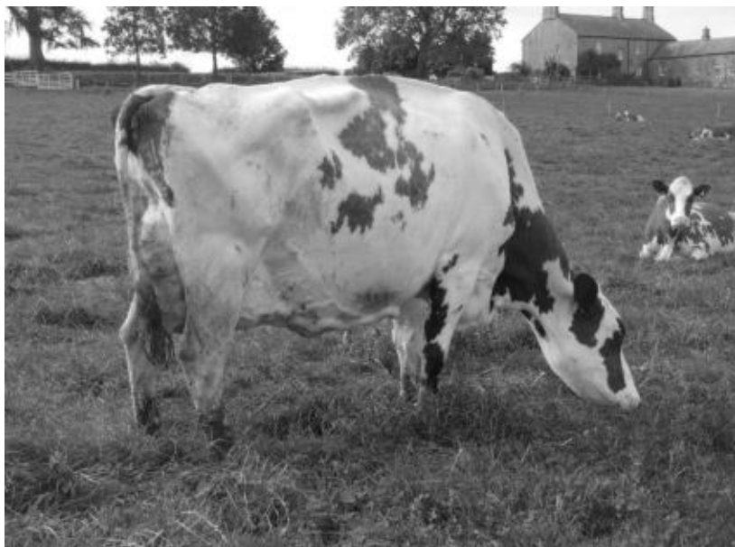
LOT 198 MIDDLE DORA HK VG86(8YR)