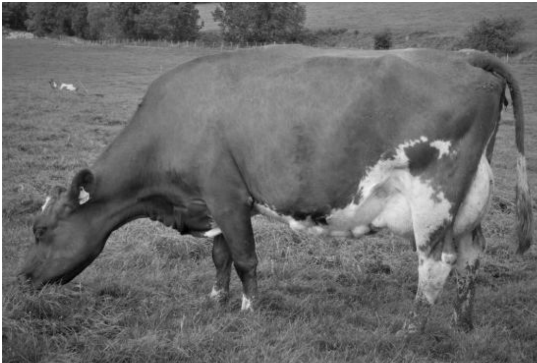
LOT 362 MIDDLE JEAN MP VG88(5YR)