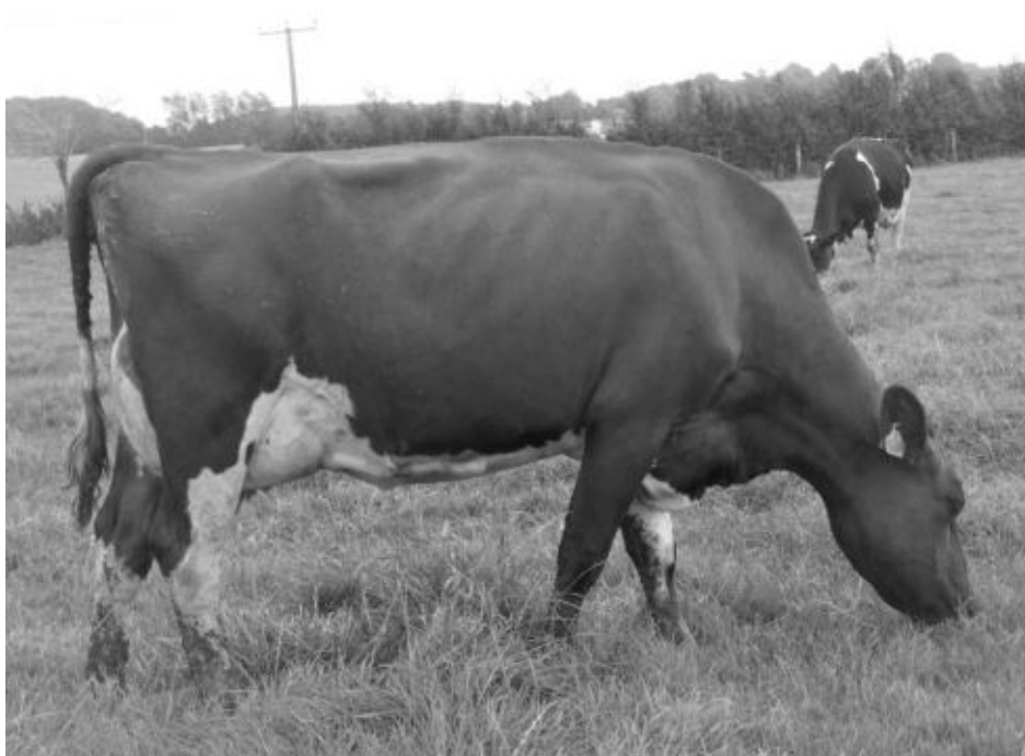
LOT 152 MIDDLE MITZY STM 2