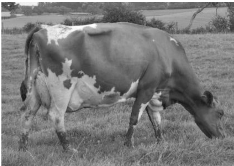
LOT 203 MIDDLE MAIDEN MBOY EX90(7YR)