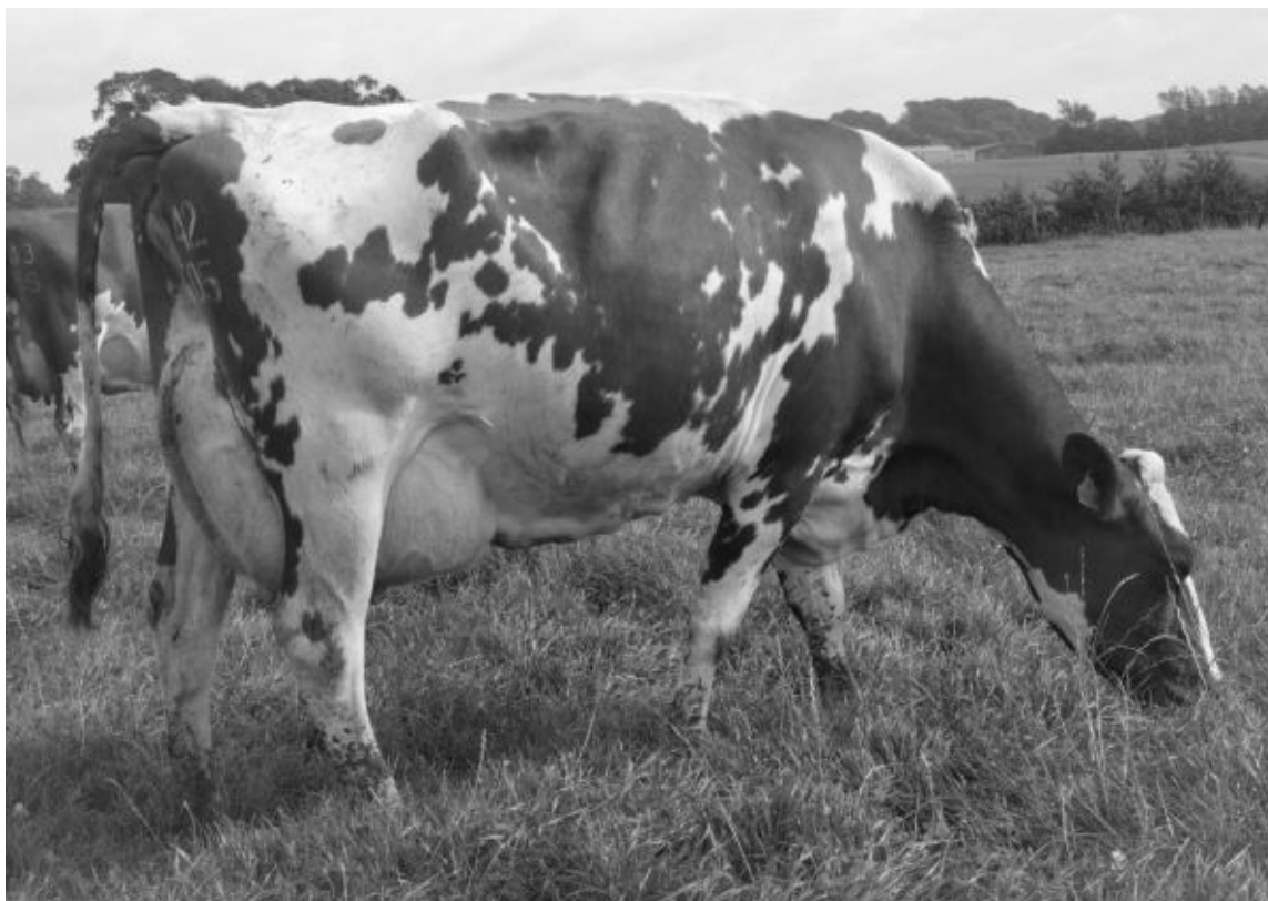
LOT 410 MIDDLE BLAEBERRY MR VG86

Dam: Middle Blaeberry Savy 1405008894 by Middle Savy 1408000062 GDam: Langside Blaeberry 106 0304115802 by Muir Major 0307190662 3d: Langside Blaeberry 85 0304108520 by Barr Quicksilver 0307190172 1 03/02 6677 3.83 3.41 305 2 04/03 7834 3.77 3.07 305