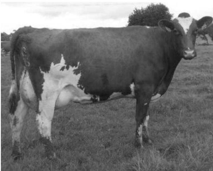
LOT 397 MIDDLE TRIPOVA CTHD GP83 VG86(5YR)