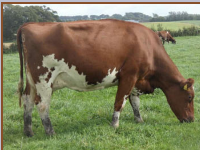
LOT 9 MIDDLE JEAN MS 6