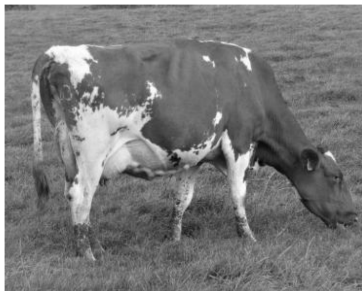
LOT 25 MIDDLE CHRISSIE MR4 VG85