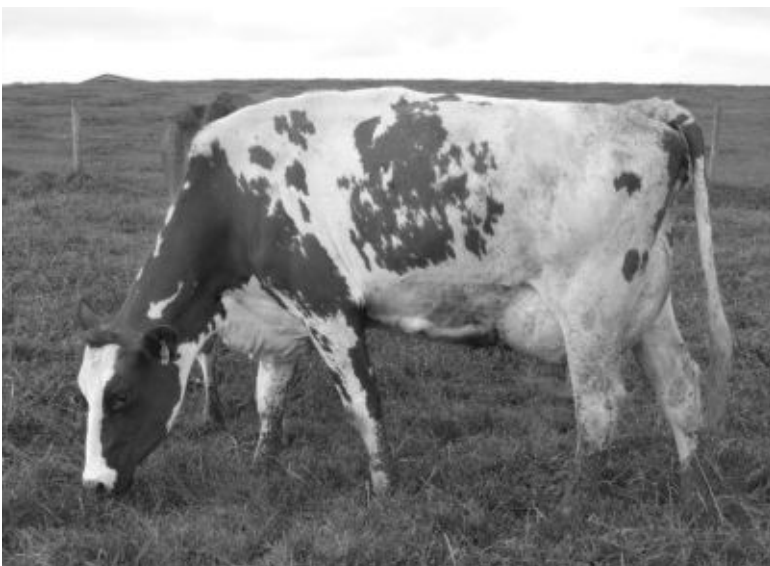
LOT 409 MIDDLE PRISCILLA MD GP82