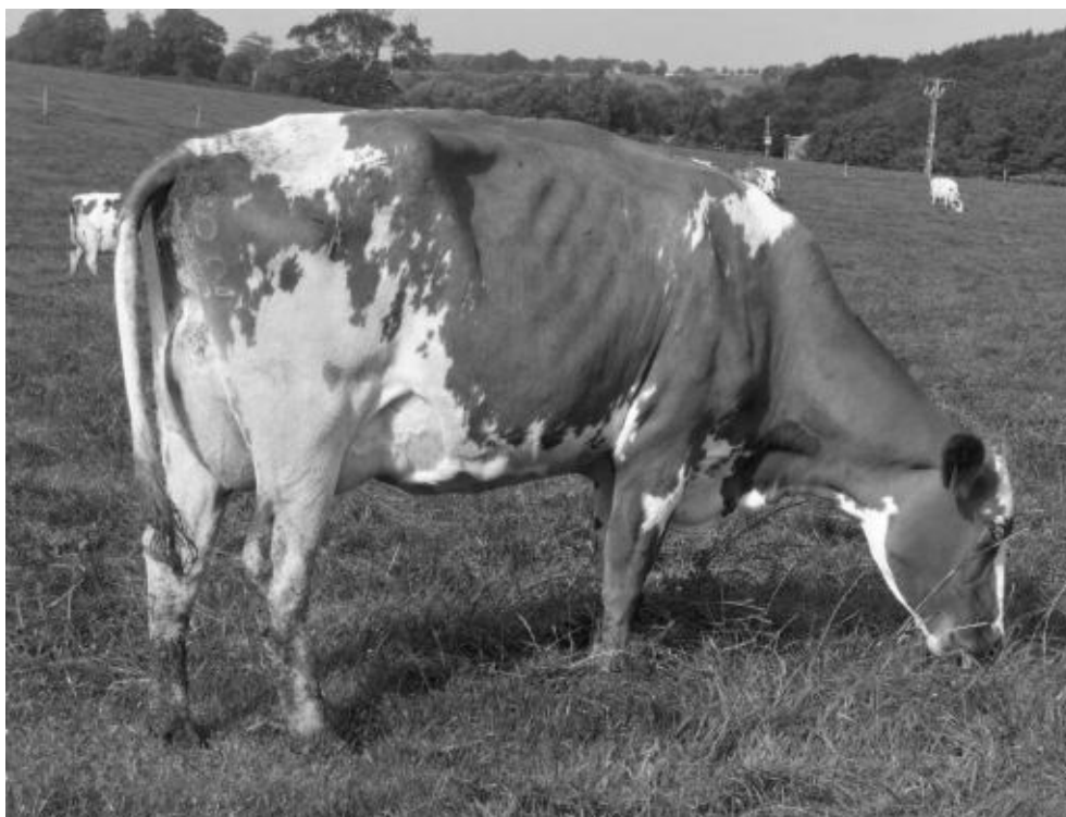
Maternal sister to LOT 110 and daughter of LOT 73

by Morwick Solano Red 0100622352 by Middle Highland Supreme 0307190433 by S F L Lyon Red 6502235358