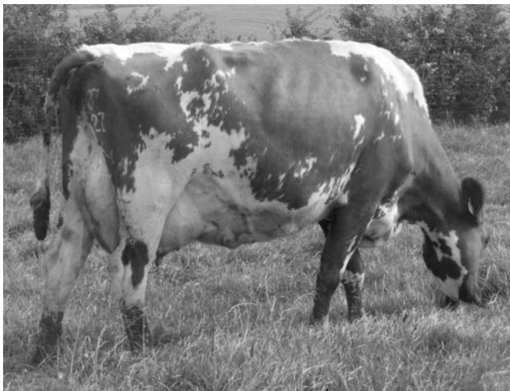
LOT 348 MIDDLE ELKINS SB EX90(5YR)