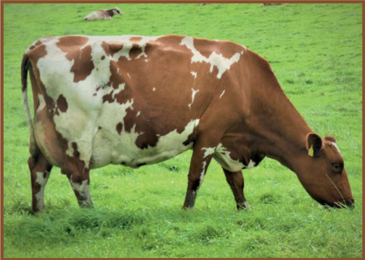
LOT 50 MIDDLE JESSIE EMJ 5 EX94