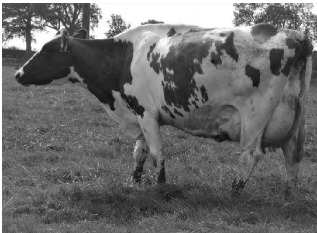
LOT 370 MIDDLE ELKIN SAVY MD EX90(5YR)