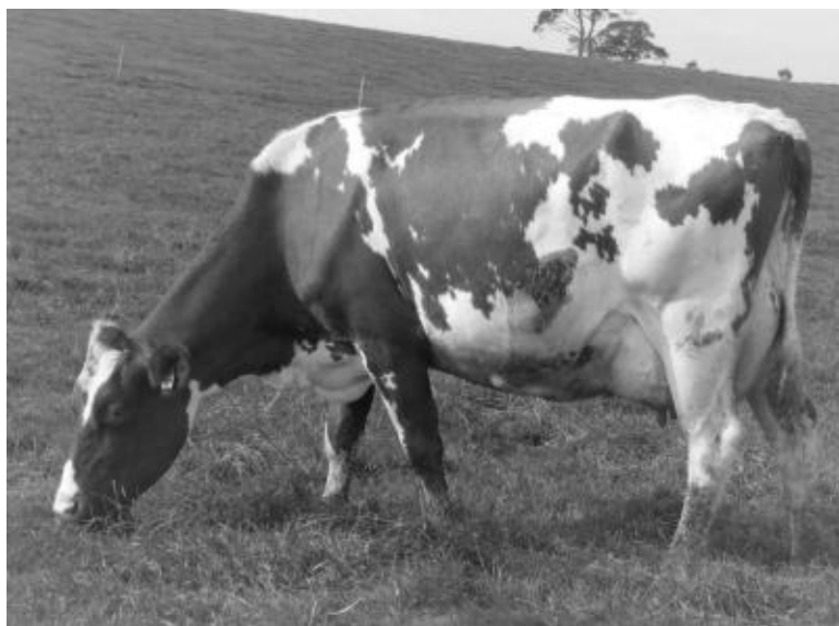
LOT 7 MIDDLE MARGOT MS 3