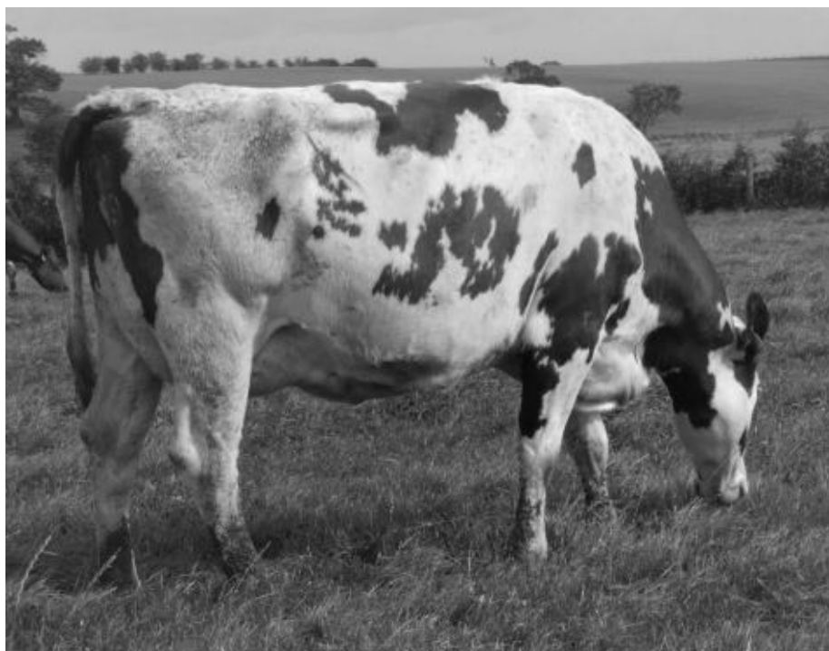
Maternal sister to LOT 175

LOT 218 MIDDLE DELIGHTFUL HK GP81 (in Group I)