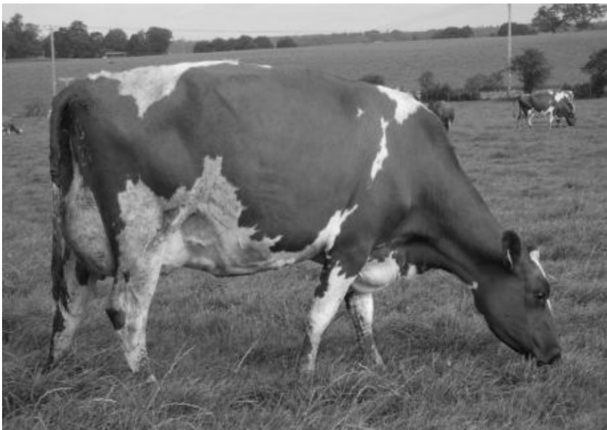
LOT 23 MIDDLE JULIA CTHD GP82