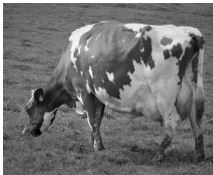
LOT 76 MIDDLE MARGOT EMJ 2 VG87