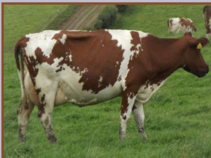
LOT 6 MIDDLE DORA MS 5 VG87