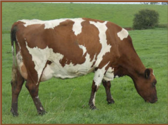
LOT 213 MIDDLE SABRINA VG86