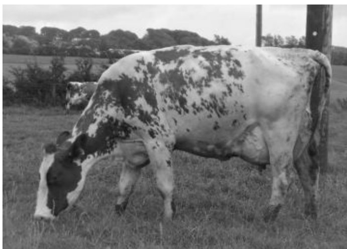
LOT 404 MIDDLE RUSHBYS MS GP82