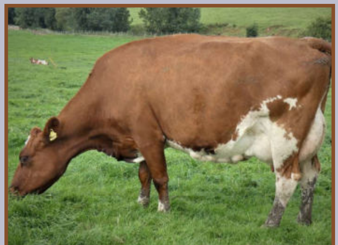
LOT 362 MIDDLE JEAN MP VG88