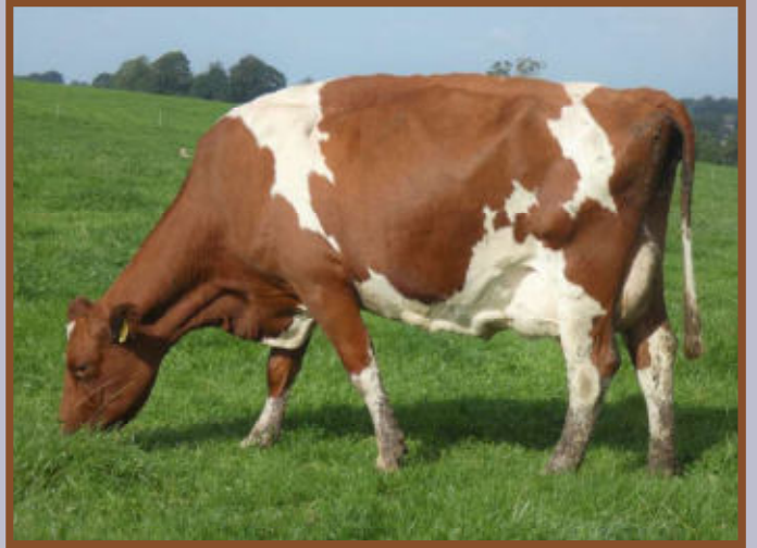
LOT 373 MIDDLE HAZELMOUNT JC